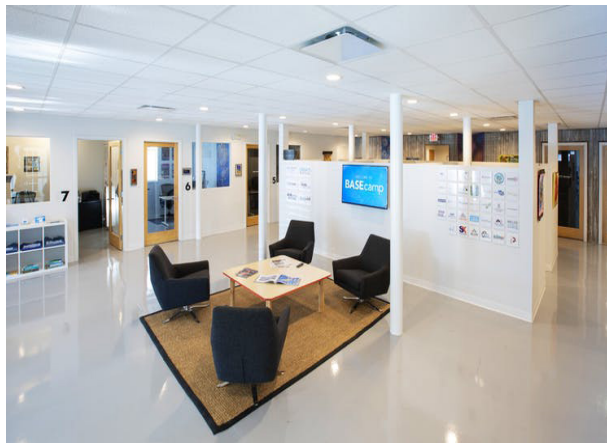
Beaufort Digital Corridor