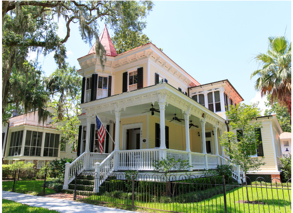
Home in Historic District